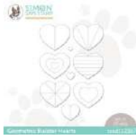
Simon Says Stamp GEOMETRIC BUILDERS...