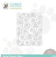
Simon Says Stamp DETAIL SWIRLS PLATE...