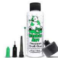
Bearly Art THE ORIGINAL Precision...