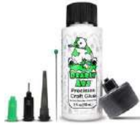
Bearly Art THE MINI Precision Craft...