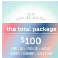
The Total Package Club Membership -...