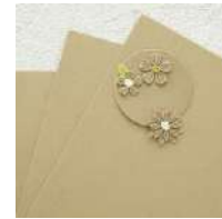
Portobello Color Essentials Cardstock...