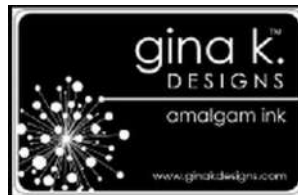
Gina K Designs OBSIDIAN Amalgam Ink...