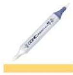
Copic Sketch Marker Y38 HONEY Bright...