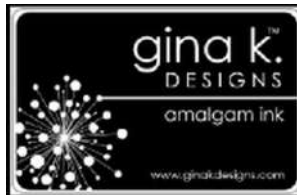
Gina K Designs OBSIDIAN Amalgam Ink...