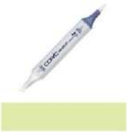
Copic Sketch Marker YG03 YELLOW GREEN...