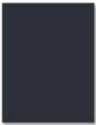
Simon Says Stamp Card Stock 100#...