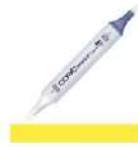
Copic Sketch Marker Y19 NAPOLI YELLOW...