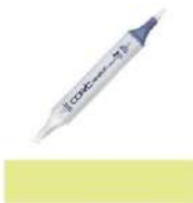
Copic Sketch Marker YG23 NEW LEAF...