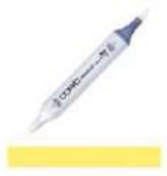
Copic Sketch MARKER Y15 CADMIUM...