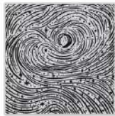
CG853 Etched Winter Swirls Bold...