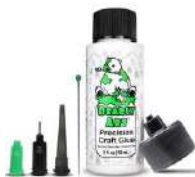
Bearly Art THE MINI Precision Craft...