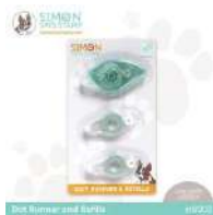
Simon Says Stamp DOT RUNNER AND 2...