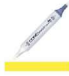
Copic Sketch Marker Y19 NAPOLI YELLOW...