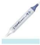
Copic Sketch Marker BG13 MINT GREEN...