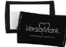
Tsukineko Versamark EMBOSS INK PAD...