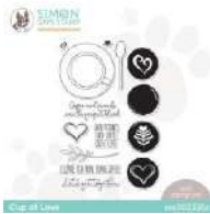
Simon Says Clear Stamps CUP OF LOVE...