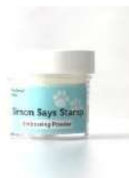
Simon Says Stamp EMBOSSING POWDER...