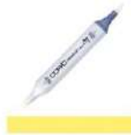
Copic Sketch MARKER Y15 CADMIUM...