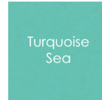
CARD STOCK 8.5 X 11- Turquoise Sea...