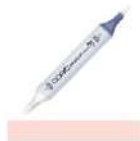
Copic Sketch Marker R20 BLUSH Pink...