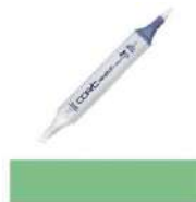
Copic Sketch Marker YG67 MOSS Dark...