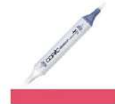
Copic Sketch Marker R46 STRONG RED...