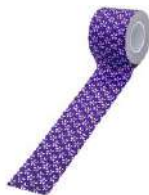
Therm O Web 0.5 INCH PURPLE TAPE Easy...