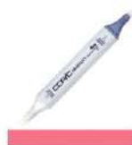
Copic Sketch Marker R35 CORAL at...