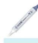
Copic Sketch Marker BG11 MOON WHITE...