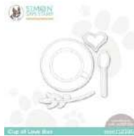
Simon Says Stamp CUP OF LOVE Wafer...