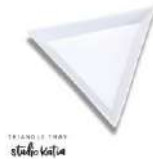
Studio Katia TRIANGLE TRAY sk2119 at...