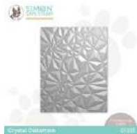
Simon Says Stamp Embossing Folder...