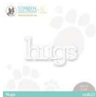
CZ Design HUGS Wafer Dies czd123...