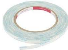
Scor-Tape 0.25 Inch Crafting Tape at...