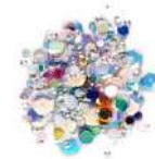
Simon Says Stamp Sequins RAINBOW...