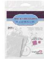
Scrapbook Adhesives THIN 3D 217 WHITE...