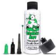
Bearly Art THE ORIGINAL Precision...