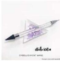
Studio Katia EMBELLISHMENT WAND sk014...