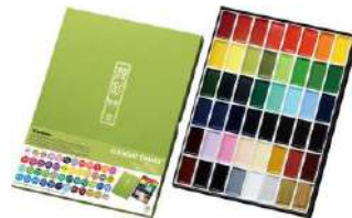
Kuretake Gansai Tambi 48 Solids...