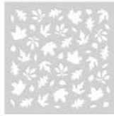
SA175 Fall Leaves Stencil - Hero Arts