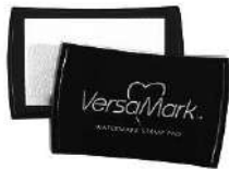
Tsukineko Versamark EMBOSS INK PAD...