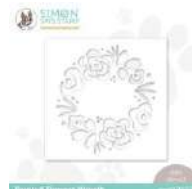
Simon Says Stamp Stencil PAINTED...