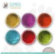
Therm O Web Simon Says Stamp RAINBOW...