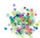
Simon Says Stamp Sequins FLOWERING...