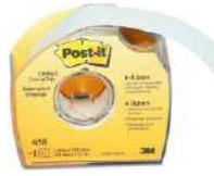
Scotch 3M POST-IT MASKING Labeling...