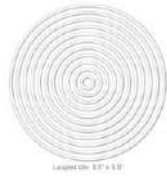
Simon Says Stamp CIRCLE THIN FRAMES...