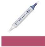
Copic Sketch Marker R59 CARDINAL...