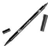
Tombow N15 BLACK Dual Brush Marker...