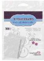
Scrapbook Adhesives 0.25 INCH 3D 308...