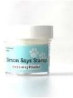
Simon Says Stamp EMBOSSING POWDER...