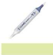
Copic Sketch Marker YG03 YELLOW GREEN...