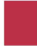
PS303 Hero Hues Premium Cardstock...