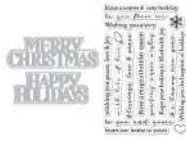
DC288 Christmas Holidays Stamp & Cut...