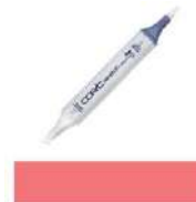
Copic Sketch Marker R24 PRAWN Red at...