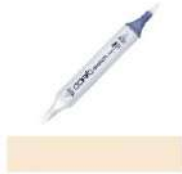
Copic Sketch Marker E31 BRICK BEIGE...