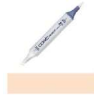
Copic Sketch MARKER E21 SOFT SUN...