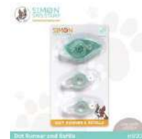
Simon Says Stamp DOT RUNNER AND 2...