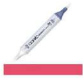
Copic Sketch Marker R46 STRONG RED...