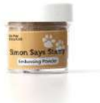
Simon Says Stamp EMBOSSING POWDER...