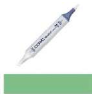
Copic Sketch Marker YG67 MOSS Dark...