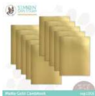
Simon Says Stamp Cardstock MATTE GOLD...