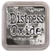
Tim Holtz Distress Oxide Ink Pad...