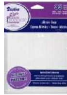
Darice ADHESIVE FOAM 33 Double Sided...