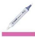
Copic Sketch MARKER RV19 RED VIOLET...