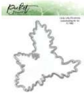
Holly Jolly Christmas Coordinating...