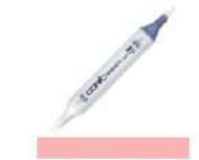
Copic Sketch Marker RV34 DARK PINK at...