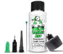
Bearly Art THE MINI Precision Craft...