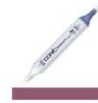
Copic Sketch Marker RV69 PEONY Dark...