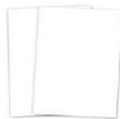
Hammermill WHITE 100 LB SMOOTH...