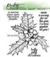
Holly Jolly Christmas “” Picket Fence...