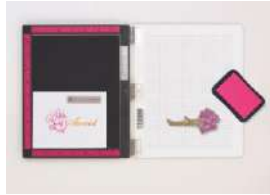
Original MISTI Version 2.0 â€“ Picket...