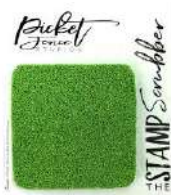
Picket Fence Studios THE STAMP...