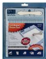
Scor-Pal MINI SCOR-BUDDY Scoring...