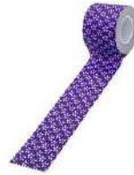
Therm O Web 0.5 INCH PURPLE TAPE Easy...