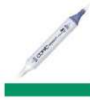
Copic Sketch MARKER G28 OCEAN GREEN...