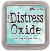
Tim Holtz Distress Oxide Ink Pad 2021...