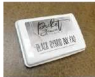
Black Hybrid Ink Pad â€“ Picket Fence...