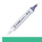
Copic Sketch Marker G19 BRIGHT PARROT...