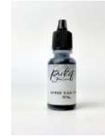
Black Hybrid Ink Refill â€“ Picket...