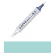
Copic Sketch Marker BG34 HORIZON...