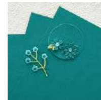
Blue Spruce Color Essentials...