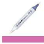
Copic Sketch Marker RV17 DEEP MAGENTA...