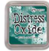
Tim Holtz Distress Oxide Ink Pad PINE...