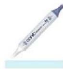
Copic Sketch Marker BG11 MOON WHITE...