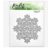
Snowflake Alice Die â€“ Picket Fence...