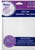
Darice ADHESIVE FOAM 33 Double Sided...