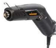
Popular Wagner Precision Heat Tool HT400