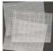
MISTI STICKY MATS Grid mistimat at...