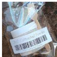
The Rabbit Hole Designs COTTONTAIL...