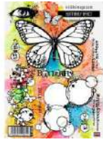
Visible Image - Clear Photopolymer...