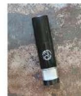
The Rabbit Hole Designs COTTONTAIL...