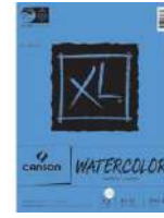
Canson XL WATERCOLOR PAPER 9x12 140lb...