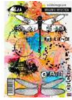
Visible Image - Clear Photopolymer...