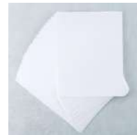
White Cardstock 8 1/2" x 11 - 25 pack