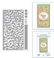
Sweet Leaf Mini Slimline Etched Dies...