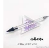
Studio Katia EMBELLISHMENT WAND sk014...