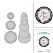
Fluted Classics Circles Etched Dies...