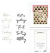
Yana's Sentiments Glimmer Hot Foil...