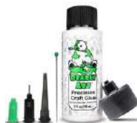
Bearly Art THE MINI Precision Craft...