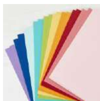
Assorted Pack Color Essentials...