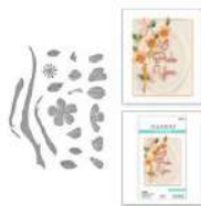
Layered Cherry Blossoms Etched Dies |...