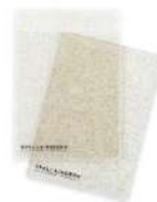
Glitter Standard Cutting Plates for...