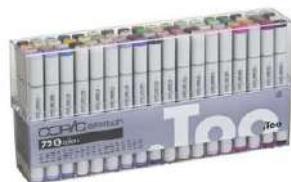
Copic SKETCH 72 PC SET E Markers...