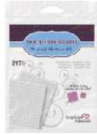
Scrapbook Adhesives THIN 3D 217 WHITE...