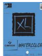
Canson XL WATERCOLOR PAPER 9x12 140lb...