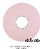
1/4 WIDE FOAM ROLL - 1/8" THICK...