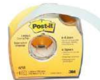
Scotch 3M POST-IT MASKING Labeling...