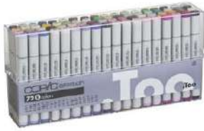
Copic SKETCH 72 PC SET E Markers...