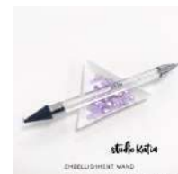
EMBELLISHMENT WAND... Studio Katia