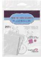
Scrapbook Adhesives THIN 3D 217 WHITE...