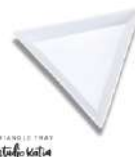
TRIANGLE TRAY - WHITE... Studio Katia