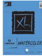
Canson XL WATERCOLOR PAPER 9x12 140lb...