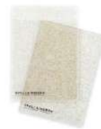
Glitter Standard Cutting Plates for...