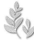
Simon Says Stamp ETCHED LAUREL LEAVES...