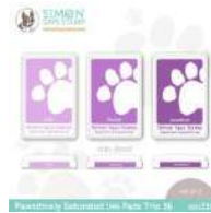
Simon Says Stamp Pawsitively...