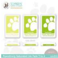
Simon Says Stamp Pawsitively...