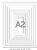
Simon Says Stamp A2 THIN FRAMES Wafer...