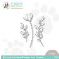
Simon Says Stamp ETCHED MEADOW FLOWER...