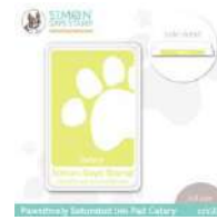
Simon Says Stamp Pawsitively...