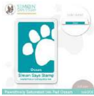
Simon Says Stamp Pawsitively...