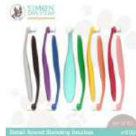
Simon Says Stamp DETAIL ROUND...