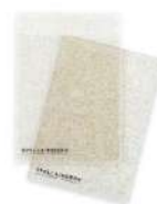
Glitter Standard Cutting Plates for...