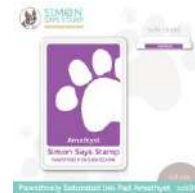
Simon Says Stamp Pawsitively...