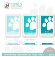
Simon Says Stamp Pawsitively...