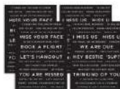
CZ Designs SENTIMENT STRIPS REVERSE...