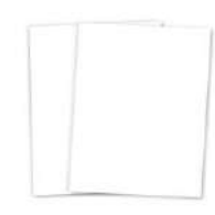
Hammermill WHITE 100 LB SMOOTH...