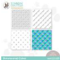
Simon Says Stamp Stencils DIMENSIONAL...