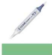
Copic Sketch Marker YG67 MOSS Dark...