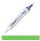
Copic Sketch Marker YG17 GRASS GREEN...