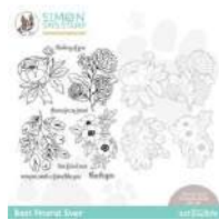
Simon Says Stamps and Dies BEST...