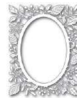
Poppy Stamps ADRIANA OVAL FRAME Craft...