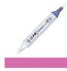
Copic Sketch Marker RV17 DEEP MAGENTA...