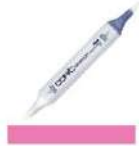
Copic Sketch Marker RV55 HOLLYHOCK...