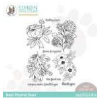
Simon Says Clear Stamps BEST FRIEND...