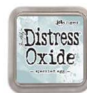
Tim Holtz Distress Oxide Ink Pad May...