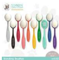
Simon Says Stamp Blending Brush SET...