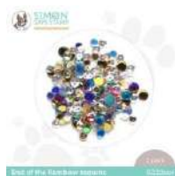
Simon Says Stamp Sequins END OF THE...