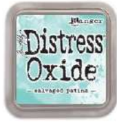
Tim Holtz Distress Oxide Ink Pad 2021...