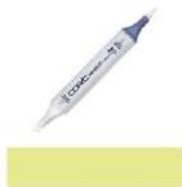
Copic Sketch Marker YG23 NEW LEAF...