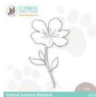
Simon Says Stamp ETCHED EVENING...