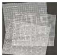
MISTI STICKY MATS Grid mistimat at...