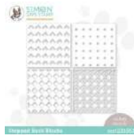
Simon Says Stamp Stencils STEPPED...