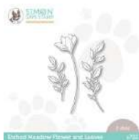
Simon Says Stamp ETCHED MEADOW FLOWER...