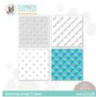
Simon Says Stamp Stencils DIMENSIONAL...