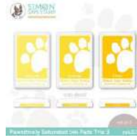
Simon Says Stamp Pawsitively...