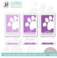
Simon Says Stamp Pawsitively...