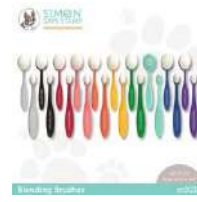
Simon Says Stamp Blending Brush SET...