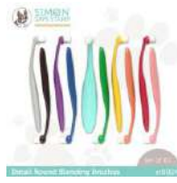
Simon Says Stamp DETAIL ROUND...