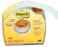
Scotch 3M POST-IT MASKING Labeling...