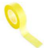
Best Ever Craft Tape