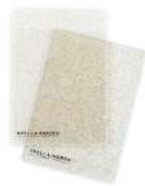
Glitter Standard Cutting Plates for...