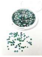
Picket Fence Studios OCEANS OF GREEN...