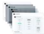
Universal Plate System | P6 Accessory...