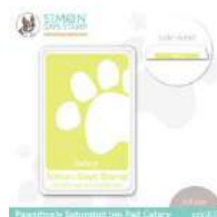
Simon Says Stamp Pawsitively...