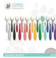
Simon Says Stamp Blending Brush SET...