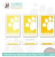
Simon Says Stamp Pawsitively...