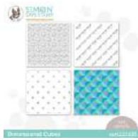
Simon Says Stamp Stencils DIMENSIONAL...