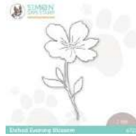
Simon Says Stamp ETCHED EVENING...