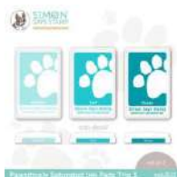
Simon Says Stamp Pawsitively...