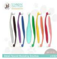
Simon Says Stamp DETAIL ROUND...