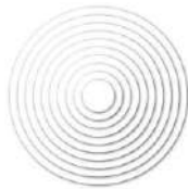
Simon Says Stamp NESTED CIRCLES Wafer...