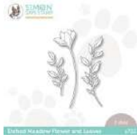
Simon Says Stamp ETCHED MEADOW FLOWER...