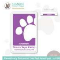
Simon Says Stamp Pawsitively...