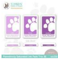
Simon Says Stamp Pawsitively...