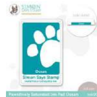
Simon Says Stamp Pawsitively...