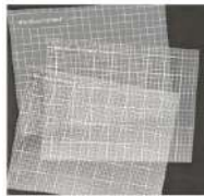
MISTI STICKY MATS Grid mistimat at...