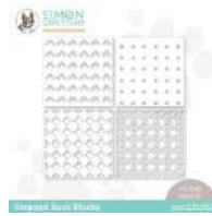
Simon Says Stamp Stencils STEPPED...