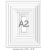
Simon Says Stamp A2 THIN FRAMES Wafer...