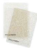
Glitter Standard Cutting Plates for...