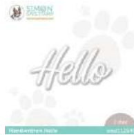
Simon Says Stamp HANDWRITTEN HELLO...