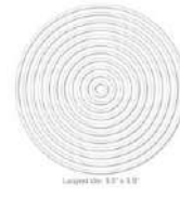
Simon Says Stamp CIRCLE THIN FRAMES...