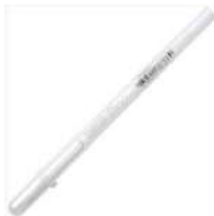
Sakura CLEAR GLAZE Gel Pen 38386 at...