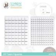
Simon Says Stamp 3D FOAM SQUARES...