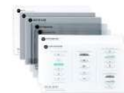
Universal Plate System | P6 Accessory...