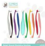
Simon Says Stamp DETAIL ROUND...