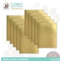
Simon Says Stamp Cardstock MATTE GOLD...