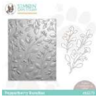
Simon Says Stamp Embossing Folder And...