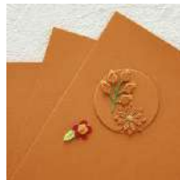
Terra Cotta Color Essentials...