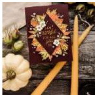
Glimmer Hot Foil Kit of the Month...