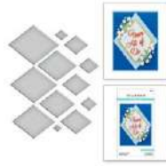
Essential Diamonds Etched Dies from...