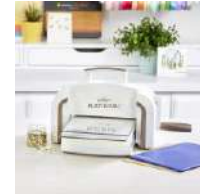
Platinum 6 Die Cutting and Embossing...