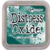
Pine Needles Distress Oxide Ink Pad €“...