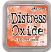
Tim Holtz Distress Oxide Ink Pad RIPE...