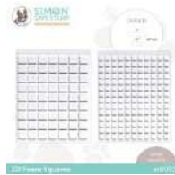
Simon Says Stamp 3D FOAM SQUARES...