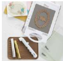
Glimmer Hot Foil System | Spell...