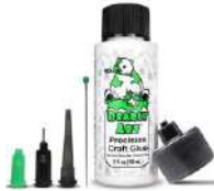
Bearly Art THE MINI Precision Craft...