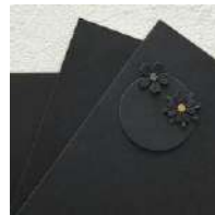
Onyx Color Essentials Cardstock 8.5"...