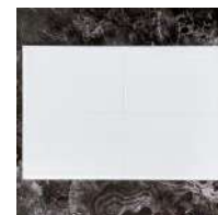
Glassboard Studio True White Glass...