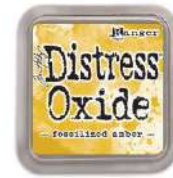
Tim Holtz Distress Oxide Ink Pad...