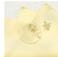
Mirror Gold Cardstock 8 1/2" x 11 -...