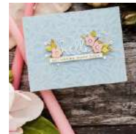
Embossing Folder Die of the Month...