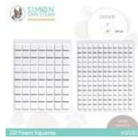
Simon Says Stamp 3D FOAM SQUARES...