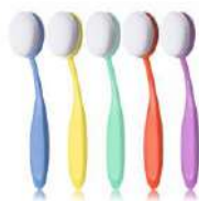
Set of 5 Rainbow Pack BLENDER BRUSHES...