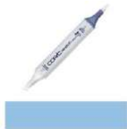
Copic Sketch MARKER b23 PHTHALO BLUE...