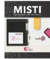
MISTI BLACK PRECISION STAMPER VERSION...