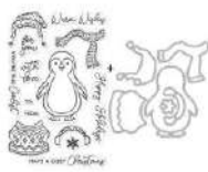
Hero Arts COZY PENGUIN Clear Stamp...