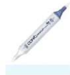
Copic Sketch Marker B00 FROST BLUE at...