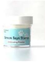
Simon Says Stamp EMBOSSING POWDER...