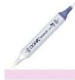
Copic Sketch Marker V12 PALE LILAC...