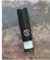
The Rabbit Hole Designs COTONTAIL...