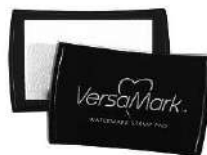
Tsukineko Versamark EMBOSS INK PAD...