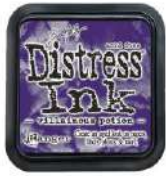
Tim Holtz Distress Ink Pad VILLAINOUS...