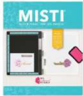
MISTI TEAL PRECISION STAMPER VERSION...