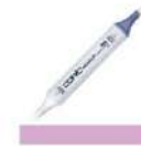
Copic Sketch Marker V15 MALLOW Violet...