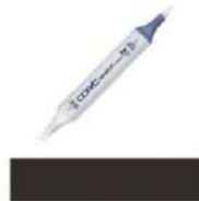
Copic Sketch MARKER 100 BLACK at...