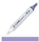
Copic Sketch Marker V17 AMETHYST...