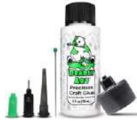
Bearly Art THE MINI Precision Craft...