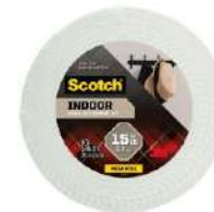
3M Scotch DOUBLE-SIDED FOAM TAPE...