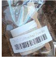
The Rabbit Hole Designs COTONTAIL...