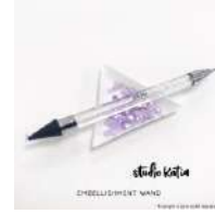
Studio Katia EMBELLISHMENT WAND sk014...