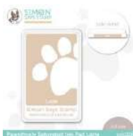
Simon Says Stamp