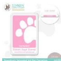
Simon Says Stamp