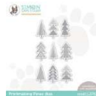
Simon Says Stamp PRINTMAKING PINES...