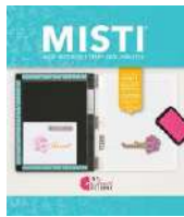
My Sweet Petunia