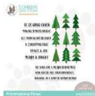
Simon Says Clear Stamps PRINTMAKING...