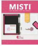
MISTI PRECISION STAMPER Stamping Tool...