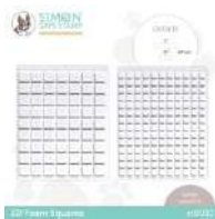
Simon Says Stamp 3D FOAM SQUARES...