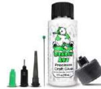
Bearly Art THE MINI Precision Craft...