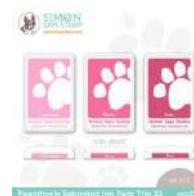
Simon Says Stamp