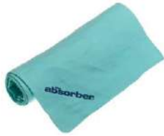
The AQUA Absorber Towel 17 x 27...