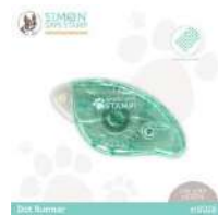
Simon Says Stamp DOT RUNNER Tape...