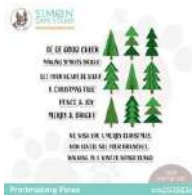
Simon Says Clear Stamps PRINTMAKING...