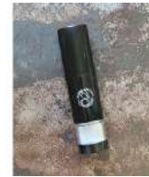
The Rabbit Hole Designs COTTONTAIL...