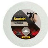
3M Scotch DOUBLE-SIDED FOAM TAPE...