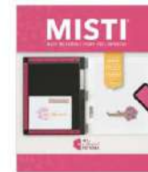
MISTI PRECISION STAMPER Stamping Tool...