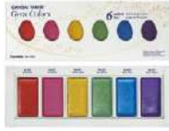
Zig Kuretaka Gansai Tambi GEM COLORS...