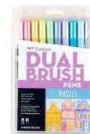
Dual Brush Pen Art Markers, Pastel,...