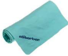
The AQUA Absorber Towel 17 x 27...