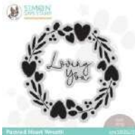
Simon Says Cling Stamps PAINTED HEART...