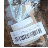
The Rabbit Hole Designs COTTONTAIL...