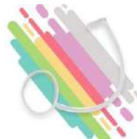
Bearly Art RUBBER STOPPER Precision...