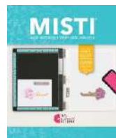
My Sweet Petunia