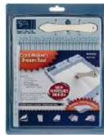
Scor-Pal MINI SCOR-BUDDY Scoring...