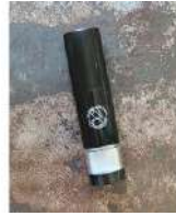
The Rabbit Hole Designs COTTONTAIL...