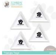
Simon Says Stamp Set of 4 TRIANGLE...