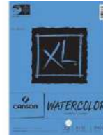
Canson XL WATERCOLOR PAPER 9x12 140lb...