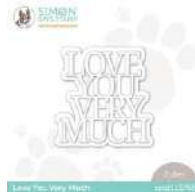
Simon Says Stamp LOVE YOU VERY MUCH...