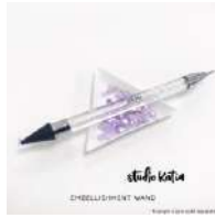
Studio Katia EMBELLISHMENT WAND sk014...