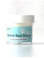
Simon Says Stamp EMBOSSING POWDER...