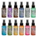
Tim Holtz Distress OXIDE SPRAY SET OF...