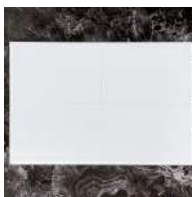
Glassboard Studio True White Glass...