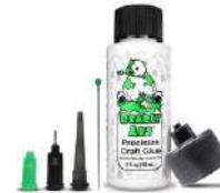
Bearly Art THE MINI Precision Craft...