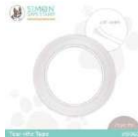
Simon Says Stamp TEAR RIFIC TAPE 1/4...