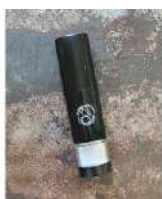
The Rabbit Hole Designs COTTONTAIL...