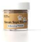
Simon Says Stamp EMBOSSING POWDER...