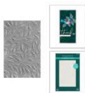
Leafy 3D Embossing Folder