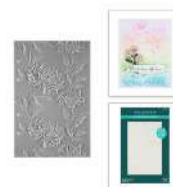
Beautiful Blooms 3D Embossing Folder...