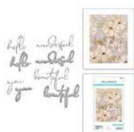
Wonderful Script Sentiments Etched...