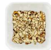
Gold | Sequins | Spellbinders Paper Arts