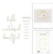
Hello, Friend Sentiments Glimmer Hot...