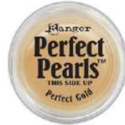
Ranger Perfect Pearls PERFECT GOLD...