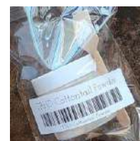
The Rabbit Hole Designs COTTONTAIL...