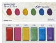
Zig Kuretake Gansai Tambi GEM COLORS...