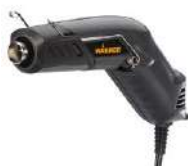
Popular Wagner Precision Heat Tool HT400