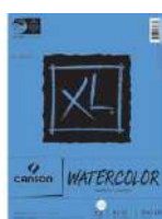
Canson XL WATERCOLOR PAPER 9x12 140lb...