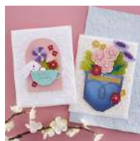
3D Embossing Folder of the Month...