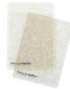
Glitter Standard Cutting Plates for...