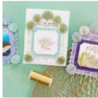
Stitching Die of the Month