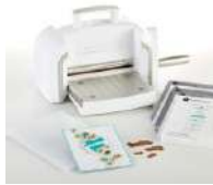
New & Improved Platinum SIX Machine...