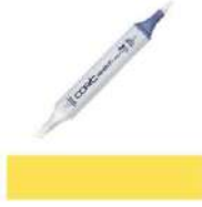
Copic Sketch Marker Y17 GOLDEN YELLOW...