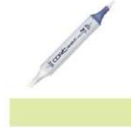
Copic Sketch Marker YG03 YELLOW GREEN...