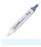
Copic Sketch Marker B00 FROST BLUE "...