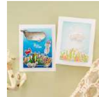
Clear Stamp & Die of the