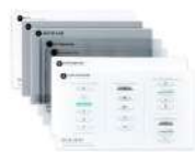
Universal Plate System | P6 Accessory...