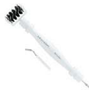
Tool 'n One for Die Cutting &...