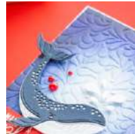
Embossing Folder Die of the