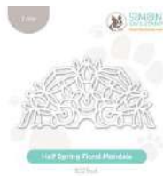
Simon Says Stamp Half Spring Floral...