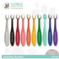
Simon Says Stamp Blending Brush SET...