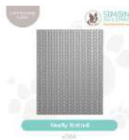
Simon Says Embossing Folder Neatly...