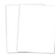
Hammermill WHITE 100 LB SMOOTH...