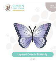
Simon Says Stamp Layered Cosmic...