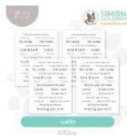
Simon Says Stamp Sentiment Strips...