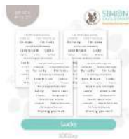
Simon Says Stamp Sentiment Strips...