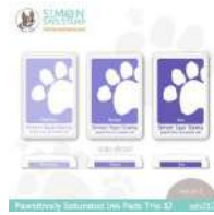
Simon Says Stamp Pawsitively...