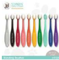
Simon Says Stamp Blending Brush SET...