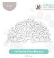
Simon Says Stamp Half Spring Floral...