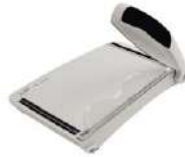
Tim Holtz Tonic GUILLOTINE COMFORT...