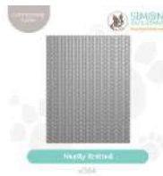
Simon Says Embossing Folder Neatly...