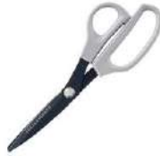
Spellbinders 9" Pro Shears |...