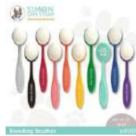
Simon Says Stamp Blending Brush SET...