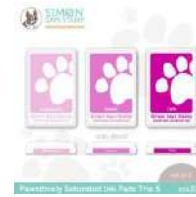
Simon Says Stamp Pawsitively...