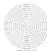
Simon Says Stamp CIRCLE THIN FRAMES...