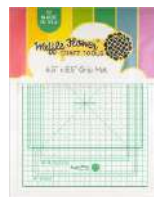
Waffle Flower 6.5 x 8.5 inch Grip Mat...