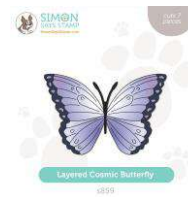
Simon Says Stamp Layered Cosmic...