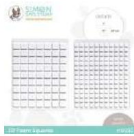
Simon Says Stamp 3D FOAM SQUARES...