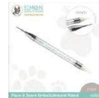
Simon Says Stamp Place And Score...