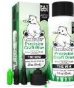
Bearly Art THE MINI Precision Craft...