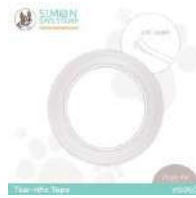
Simon Says Stamp TEAR RIFIC TAPE 1/4...