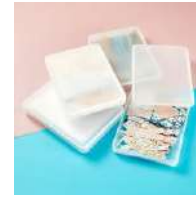
Craft Stax Medium Tray Set |...