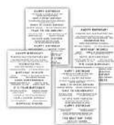
Simon Says Stamp SENTIMENT STRIPS...