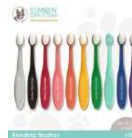
Simon Says Stamp Blending Brush SET...