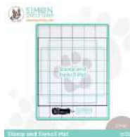
Simon Says Stamp Stamp And Stencil...