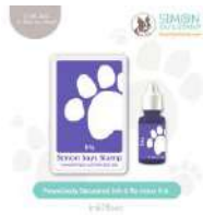
Simon Says Stamp Pawsitively...