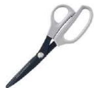
Spellbinders 9" Pro Shears |...