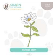
Simon Says Stamp Sunrise Stem Wafer...