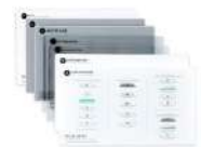
Universal Plate System | P6 Accessory...