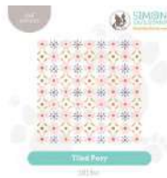
Simon Says Stamp Stencils Tiled Posy...