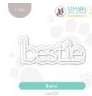
CZ Design Bestie Wafer Dies czd228...