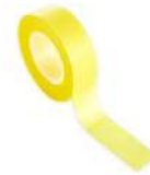
Best Ever Craft Tape