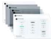
Universal Plate System | P6 Accessory...