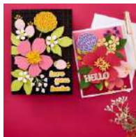
Large Die of the Month Membership -...

Here is a list of products used for today's cards. Affiliate links have been used at no additional cost to you. If you click on a link and make a purchase, I receive a small commission. And, thank you if you do.