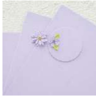
Purple Mist Color Essentials...