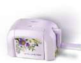
Platinum Scout Lilac Shimmer Machine...