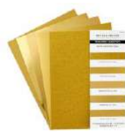
Gold Assortment Treasured Cardstock 8...