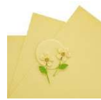
Chamomile Color Essential Cardstock...