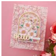
3D Embossing Folder of the Month...