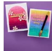
Embossing Folder Die of the Month...