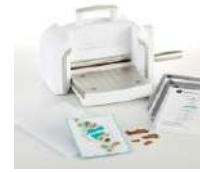
New & Improved Platinum SIX Machine...