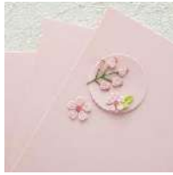
Pink Sand Color Essentials Cardstock...