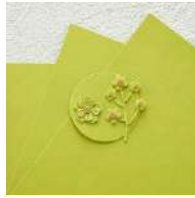
Rainforest Color Essentials Cardstock...