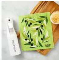
Mighty Mister Spray Bottle - ...