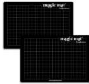
Scrapbook.com - Magic Mat - Standard...