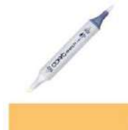
Copic Sketch Marker YR04 CHROME...