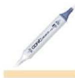
Copic Sketch Marker YR21 CREAM Light...