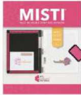
MISTI PRECISION STAMPER VERSION 2.0...