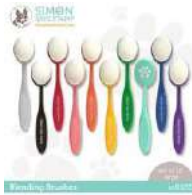
Simon Says Stamp Blending Brush SET...