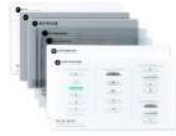
Universal Plate System | P6 Accessory...