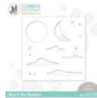
Simon Says Stamp Stencil NIGHT SKY...