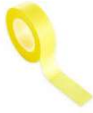
Best Ever Craft Tape