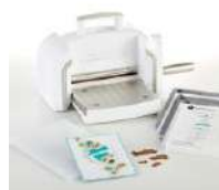
New & Improved Platinum SIX Machine...