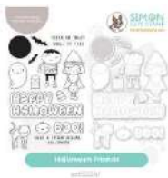
Simon Says Stamps and Dies Halloween...