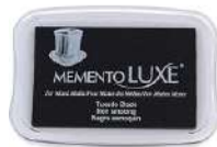
Tsukineko Memento Luxe TUXEDO BLACK...