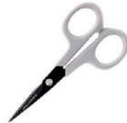
Spellbinders 4 Inch Detail Scissors...