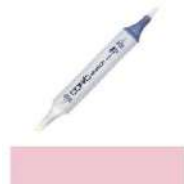
Copic Sketch Marker R81 ROSE PINK...