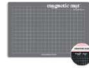
Magnetic Magic Mat - Standard -...