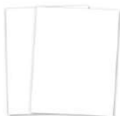
Hammermill WHITE 100 LB SMOOTH...