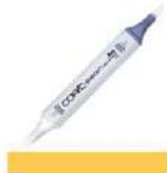
Copic Sketch Marker YR15 PUMPKIN...