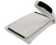
Tim Holtz Tonic GUILLOTINE COMFORT...