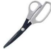
Spellbinders 9 inch Pro Shears T-042...