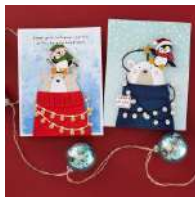
Small Die of the Month Membership -...