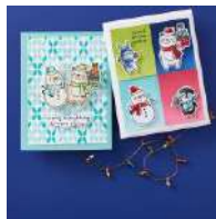
Clear Stamp & Die of the Month Club -...