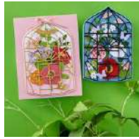
Large Die of the Month Membership -...