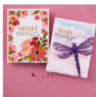
Clear Stamp & Die of the Month Club -...