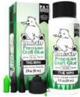
Bearly Art THE MINI Precision Craft...