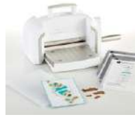
New & Improved Platinum SIX Machine...