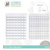
Simon Says Stamp 3D FOAM SQUARES...