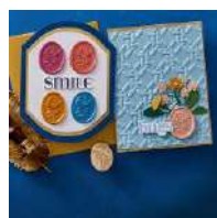
Wax Seal of the Month Membership -...