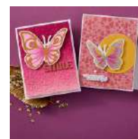
Embossing Folder Die of the Month...