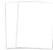
Hammermill WHITE 100 LB SMOOTH...