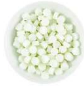
Glow-in-the-Dark Wax Beads from the...