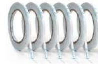
Clear Double Sided Adhesive Roll 1/4...