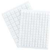
White Foam Squares Mix 1MM Adhesive |...