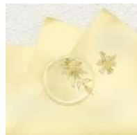
Mirror Gold Cardstock 8 1/2" x 11 -...