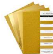
Gold Assortment Treasured Cardstock 8...