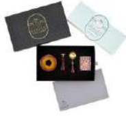
Wax Seal Starter Kit from the Sealed...