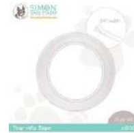
Simon Says Stamp TEAR RIFIC TAPE 1/4...