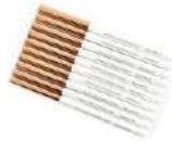
Waffle Flower 10 Pack SHADER BRUSH 0...