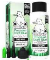
Bearly Art THE MINI Precision Craft...