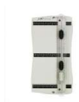
Tim Holtz Tonic Precision Trimmer...