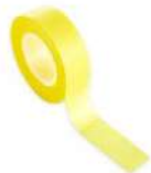
Best Ever Craft Tape