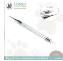
Simon Says Stamp Place And Score...