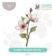
Simon Says Stamp Elegant Blossom...