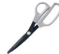
Spellbinders 9" Pro Shears |...