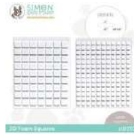
Simon Says Stamp 3D FOAM SQUARES...