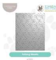
Simon Says Stamp Embossing Folder...