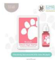
Simon Says Stamp Pawsitively...