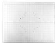
True White Glass Craft Mat â€”...