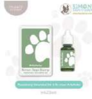
Simon Says Stamp Pawsitively...