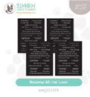
Simon Says Stamp Sentiment Strips...