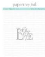
Papertrey Ink LARGER THAN LIFE LOVE...