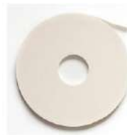
Simon Says Stamp BIG MOMMA FOAM TAPE...