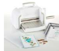
New & Improved Platinum SIX Machine...