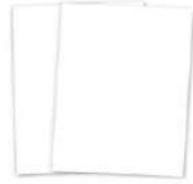
Hammermill WHITE 100 LB SMOOTH...