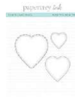
Papertrey Ink - Love to Layer: Hearts...