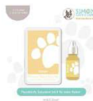
Simon Says Stamp Pawsitively...