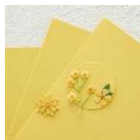
Beeswax Color Essentials Cardstock...