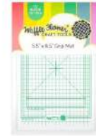
Waffle Flower 5.5 x 8.5 inch Grip Mat...