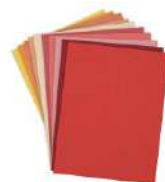
Warm Assortment ColorWheel Cardstock...