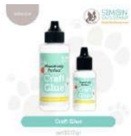
Simon Says Stamp Pawsitively Perfect...