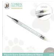
Simon Says Stamp Place And Score...