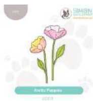
Simon Says Stamp Arctic