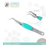
Simon Says Stamp REVERSE TWEEZERS st0106