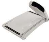
Tim Holtz Tonic GUILLOTINE COMFORT...