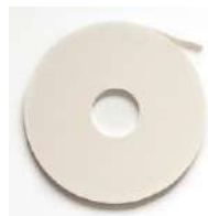
Simon Says Stamp BIG MOMMA FOAM TAPE...