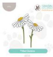
Simon Says Stamp Tilted