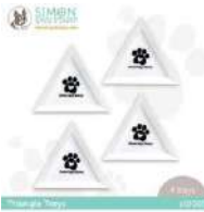
Simon Says Stamp Set of 4 TRIANGLE...