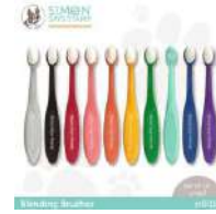
Simon Says Stamp Blending Brush SET...