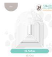
Simon Says Stamp A2 Arches